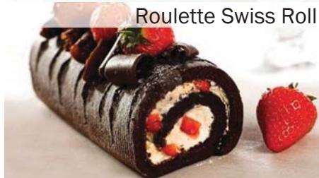
Roulette Swiss Roll