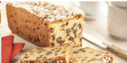
Festive Fruit Cake