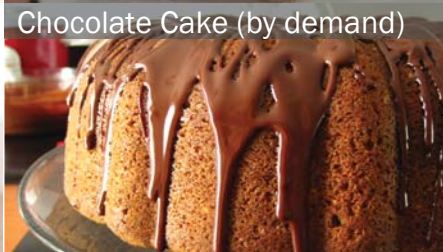
Chocolate Cake (by demand)

Images shown are for illustration purposes only.