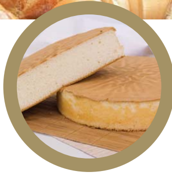
Gluten-Free Sponge Cake