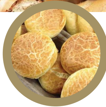
Maize Panini & Corn Burger Buns