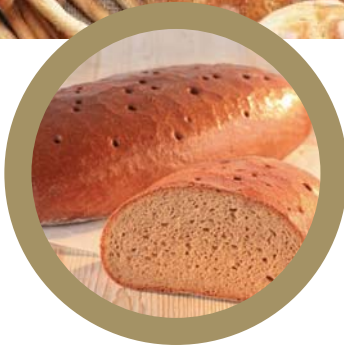
Munich-Style House Bread