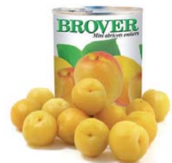
Whole Mini Apricots 25 ~ 30 pcs BRVAPR 1 tin x 850 g