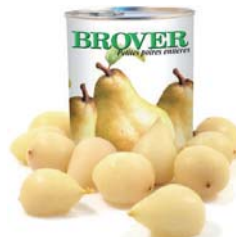
Whole Mini Pears 14 ~ 16 pcs BRVPR 1 tin x 850 g