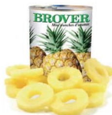
Sliced Mini Pineapples 30 ~ 33 pcs BRVFNAPL 1 tin x 850 g