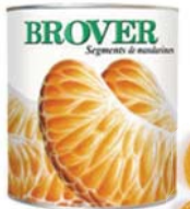
Mandarin Segments BRVMDR 1 tin x 850 g