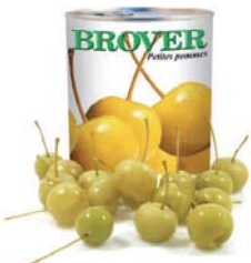
Whole Mini Apples 17 ~ 23 pcs BRVAPL 1 tin x 425 g