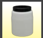
Container with lid (700 ml) KRE-09-490-012