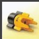
Nozzle - Flat jet F7S (Flat surface, thin liquid) KRE-09-490-005