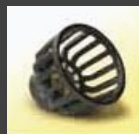
Nozzle -Round jet R8 (All surface, thick liquid) KRE-09-490-008