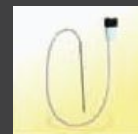
Suction feed extension (for LM45) KRE-09-450-001