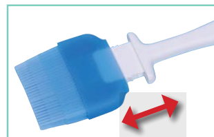
Bristle head can be separated from handle for cleaning.