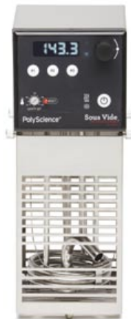
Classic Series (Indent) CAT-7306AC2P5 312 x 117 x h146 mm