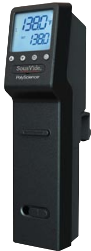
CAT-SVC-AC2P-240V 98 x 187 x h359 mm

Economic benefits include less shrinkage with expensive meat cuts, better results with secondary cuts, balancing workload, excellent portion control and less product waste.