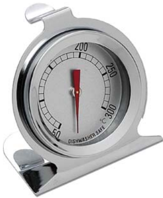
MATR250350 Stainless steel with dial Ø60 mm