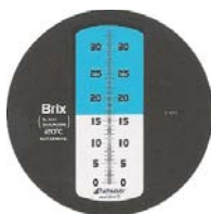
LAB-ATG-IT * Master-T, handheld