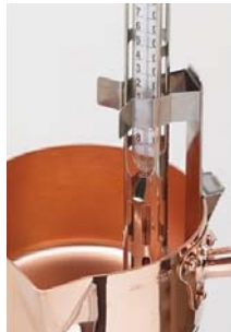
Thermometer Holder MAO-MRTE 137 mm

* 3 months warranty against manufacturing defects only. Please check condition of product upon purchase.