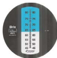
LAB-ATG-4T * Master-4T, handheld