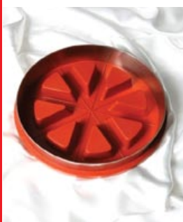
ZCM-8 Round, 8 Slices Ø 180 x H 40 (mm)