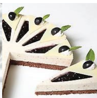
ZCM-12 Round, 12 Slices Ø 250 x H 40 (mm)