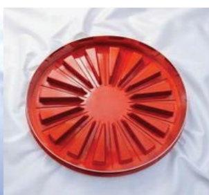
ZCM-16 Round, 16 Slices Ø 313 x H 40 (mm)