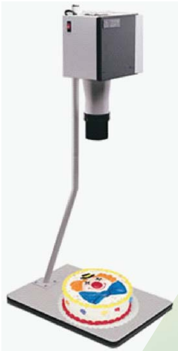
KOP302XK Kopyrite Projector with Base